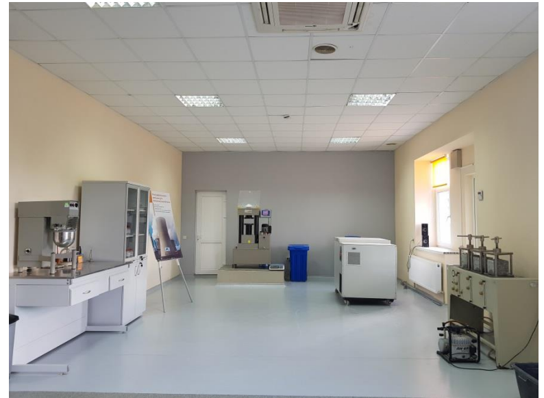
Concrete Laboratory of MC-Bauchemie in Berezan