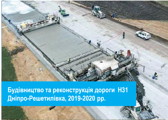
Будівництво та реконструкція дороги Н31 Дніпро-Решетилівка, 2019-2020 рр.