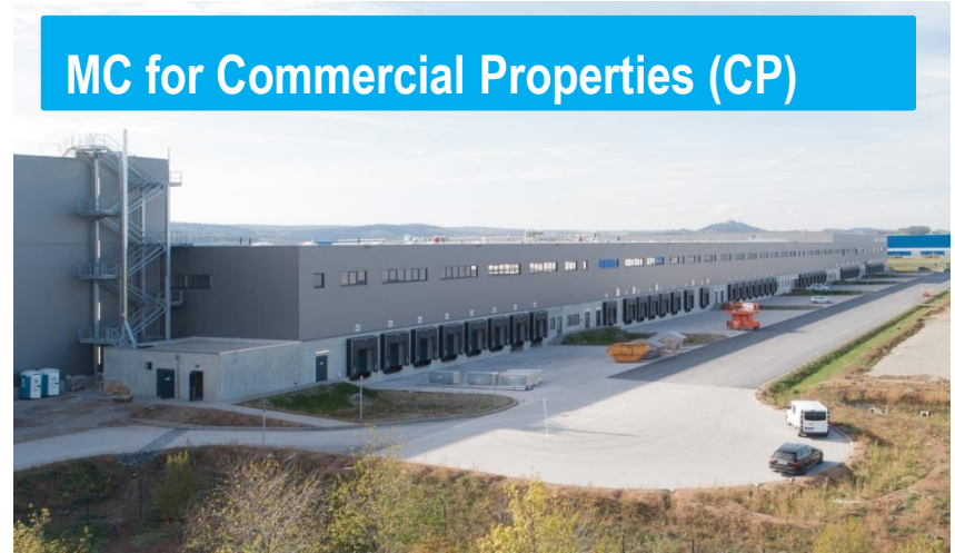
MC for Commercial Properties (CP)