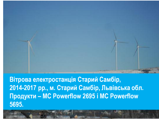
Вітрова електростанція Старий Самбір, 2014-2017 рр., м. Старий Самбір, Львівська обл. Продукти – MC Powerflow 2695 і MC Powerflow 5695.