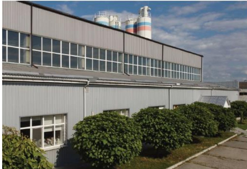
Factory of MC-Bauchemie in Berezan