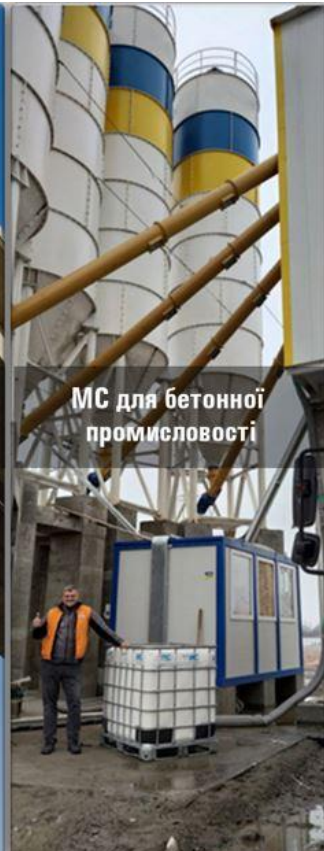
МС для бетонної промисловості