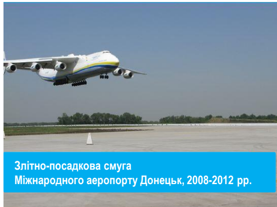
Злітно-посадкова смуга Міжнародного аеропорту Донецьк, 2008-2012 рр.