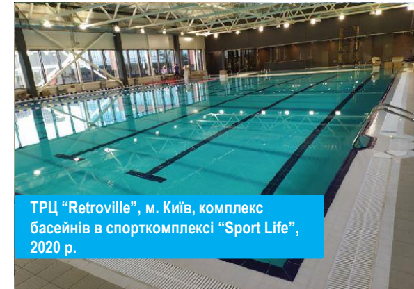
ТРЦ “Retroville”, м. Київ, комплекс басейнів в спорткомплексі “Sport Life”, 2020 р.