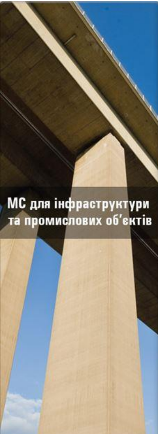
МС для інфраструктури та промислових об'єктів