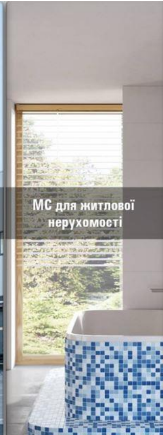
МС для житлової нерухомості