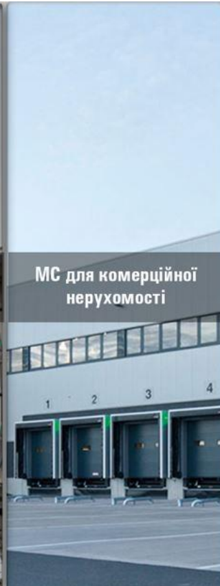
МС для комерційної нерухомості