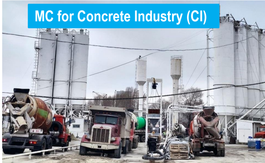
MC for Concrete Industry (CI)